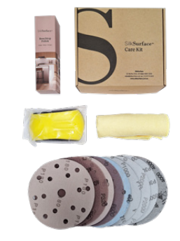
SilkSurface Care Kit for keeping your top as good as new