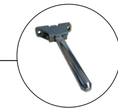
Comes complete with two super sturdy mounting brackets.