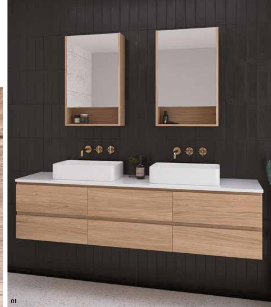
[01.] Ashton Vanity in Tassie Oak Texture.

Texture in a bathroom regardless of the type, adds an earthy sophistication.